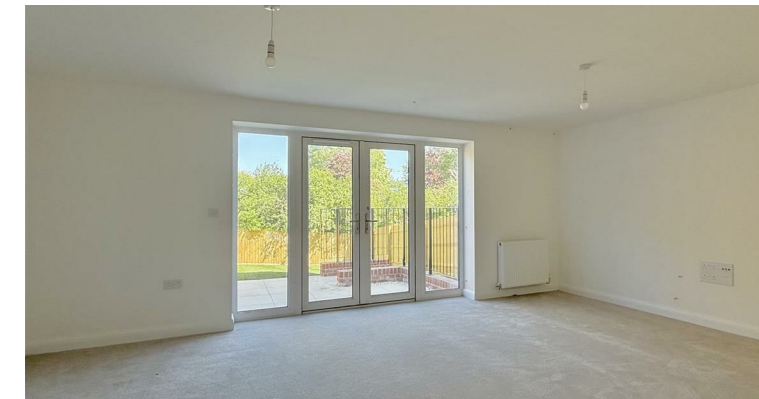
3 Bed House - Semi- Plot 8 Limers Lane, Northam, Bideford, EX39 2RJ